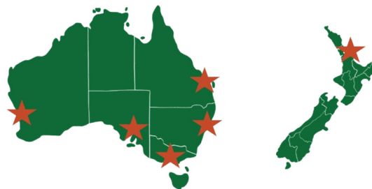
Figure 1: Map of HSK Ward Group direct operations

The group is headquartered in Melbourne & also has staff located in Brisbane, Sydney, Adelaide, Perth & Auckland.