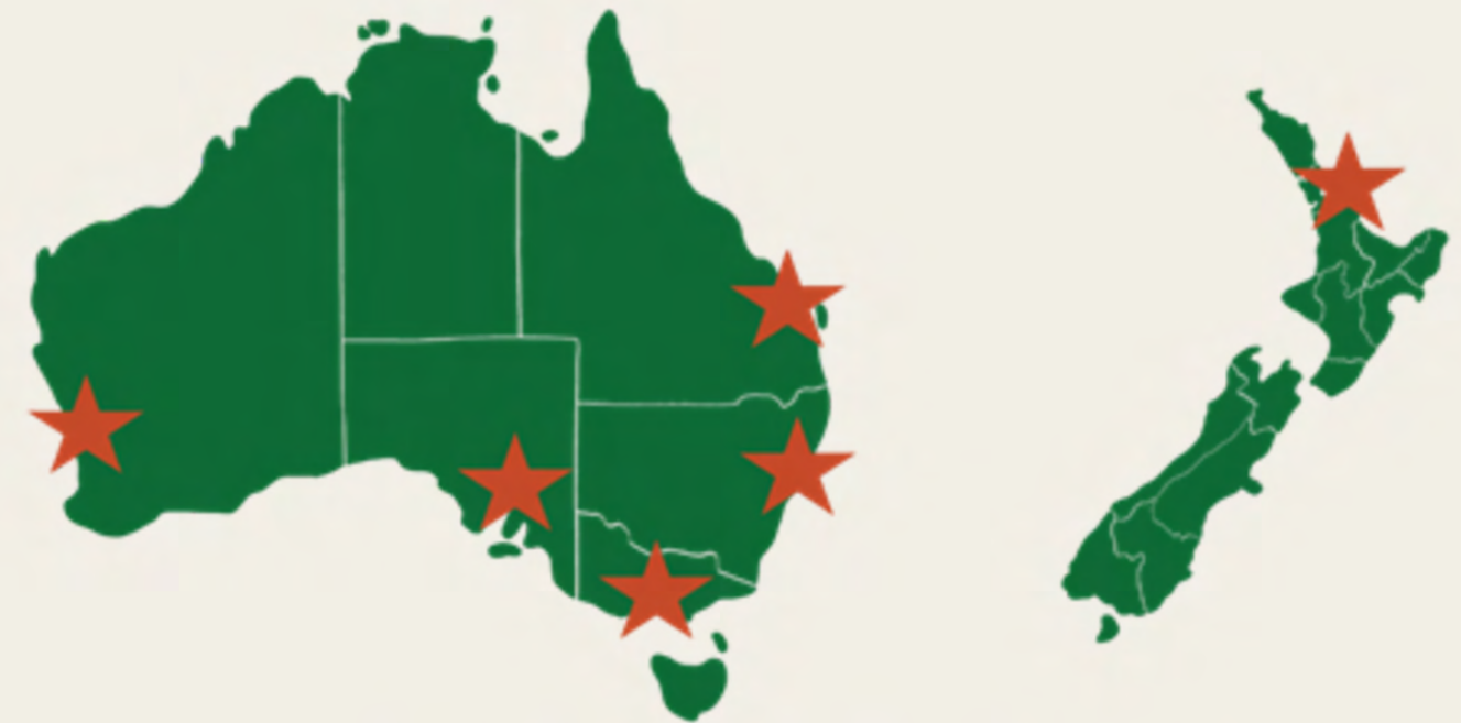
Figure 1: Map of HSK Ward Group direct operations

FTA Coffee supplies roasters with certified carbon neutral green coffee beans.